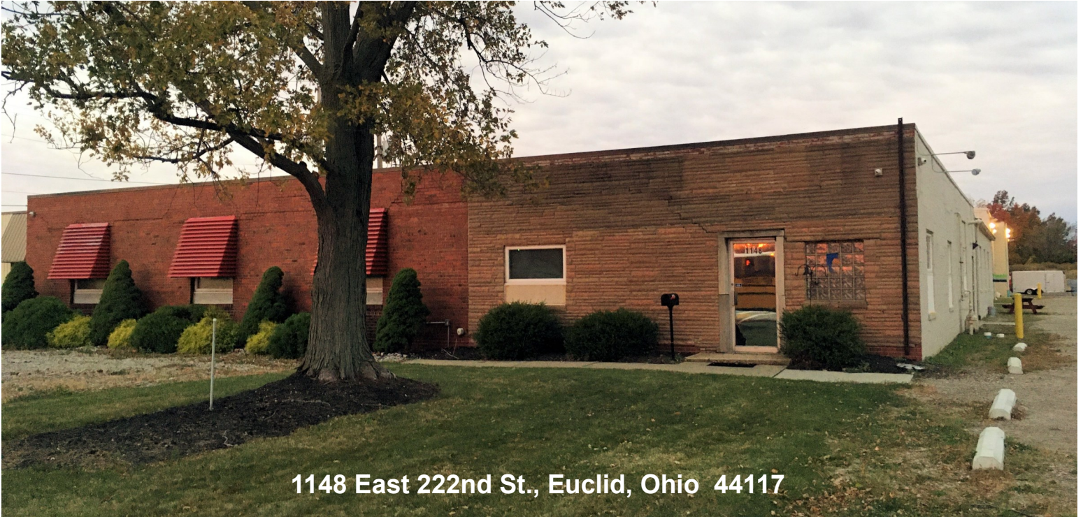
1148 East 222nd St., Euclid, Ohio 44117