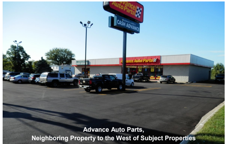
Advance Auto Parts, Neighboring Property to the West of Subject Properties