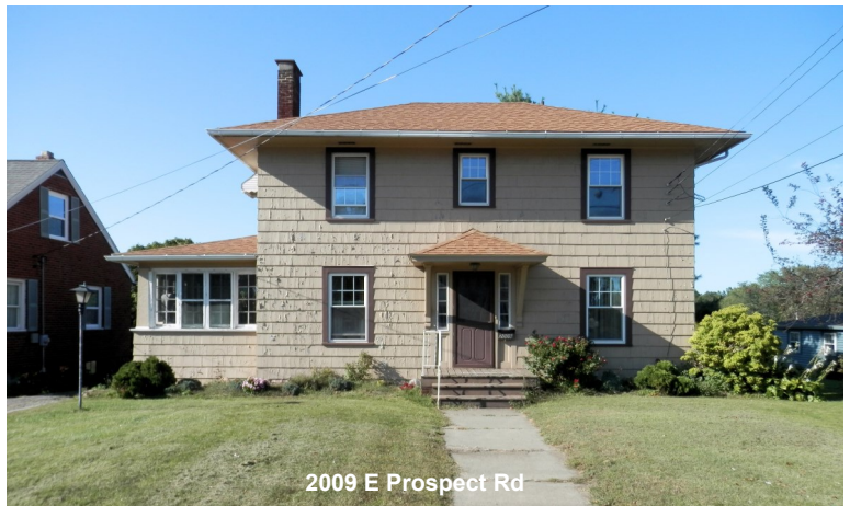
2009 E Prospect Rd