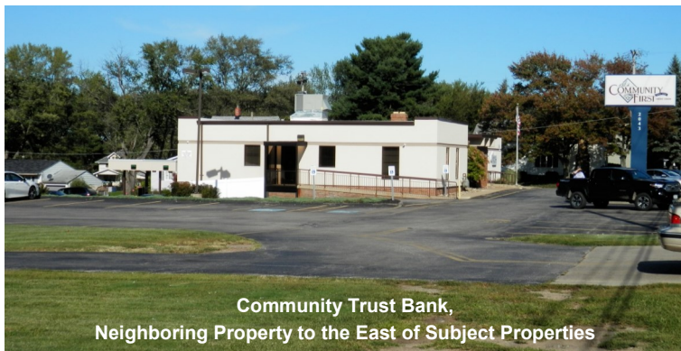
Community Trust Bank, Neighboring Property to the East of Subject Properties