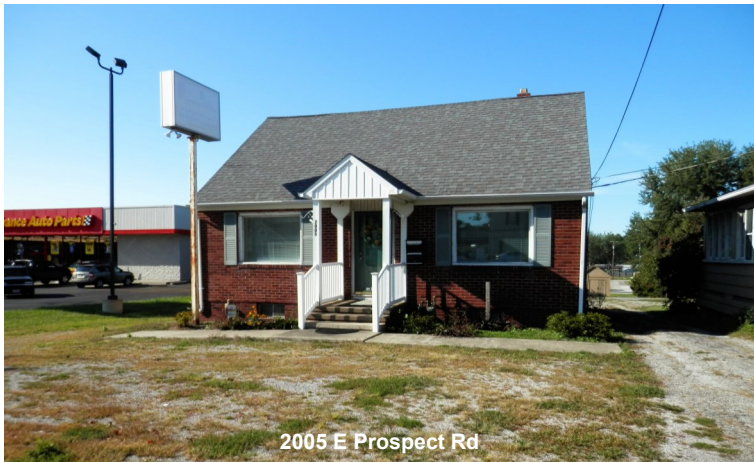
2005 E Prospect Rd