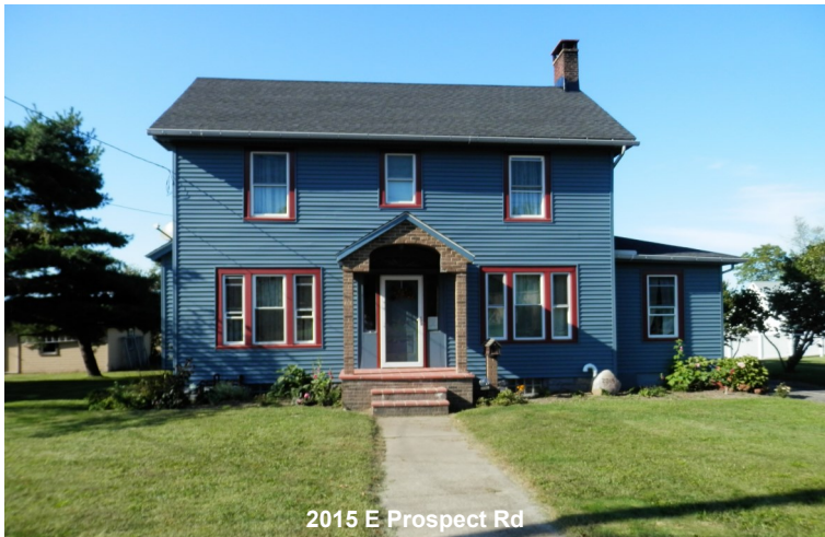
2015 E Prospect Rd