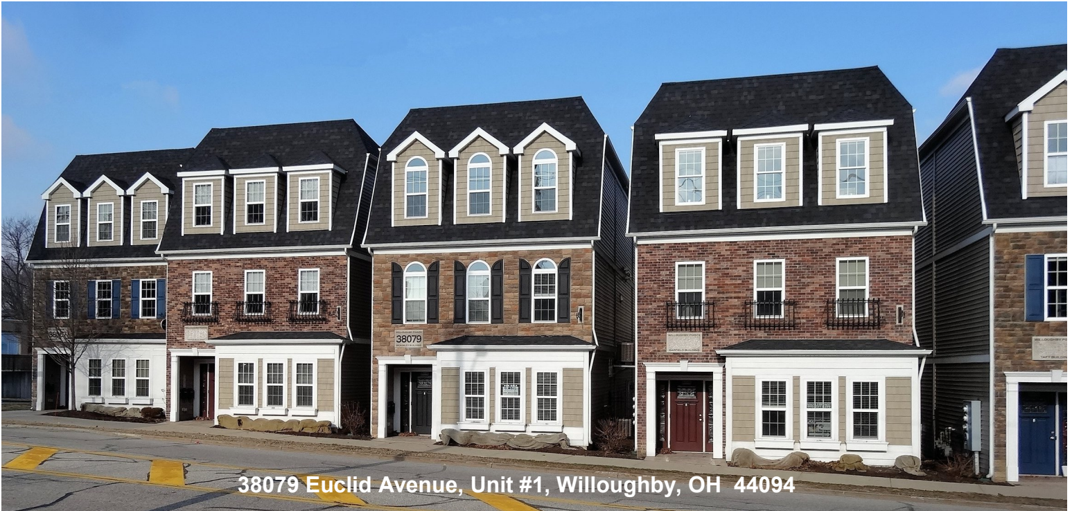
38079 Euclid Avenue, Unit #1, Willoughby, OH 44094