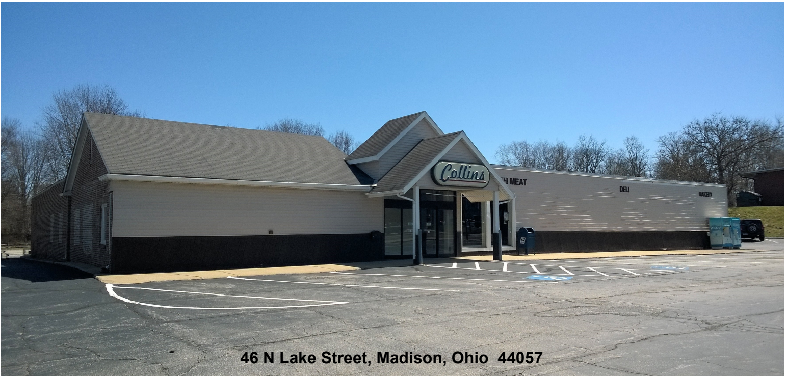
46 N Lake Street, Madison, Ohio 44057