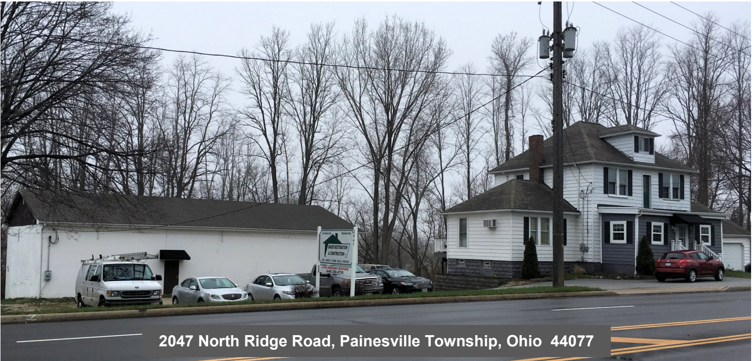
2047 North Ridge Road, Painesville Township, Ohio 44077